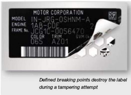
Defined breaking points destroy the label during a tampering attempt

STRANGE COMPANIONS BUT NATURAL ALLIES WHEN FORM FOLLOWS FUNCTION IN DESIGN.